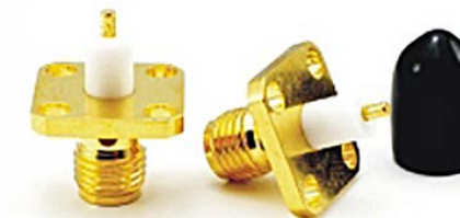
ID039 SMA female panel solder flang mount