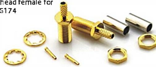
ID025 SMA bulkhead female for RG316 RG174