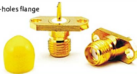
ID047 SMA jack 2-holes flange mount 11