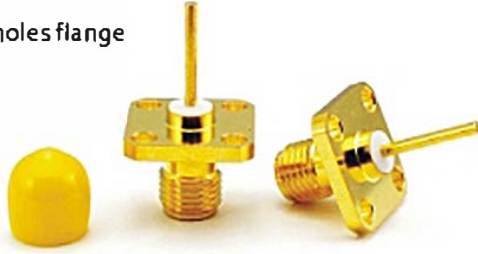
ID041 SMA jack 4-holes flange mount 13