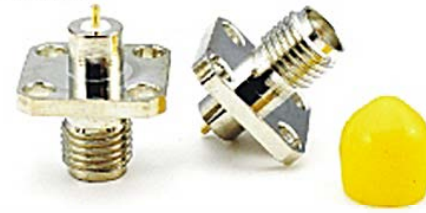
ID042 SMA jack 4-holes flange mount 51