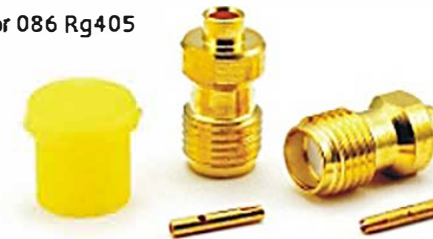
ID037 SMA female for 086 Rg405