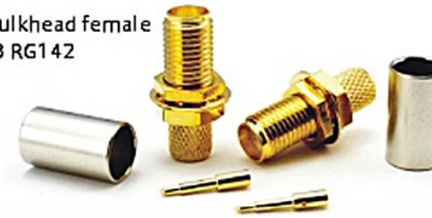
ID031 RP SMA bulkhead female for RG223 RG142