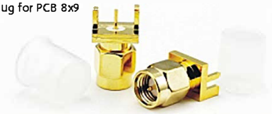
ID056 SMA plug for PCB 8x9