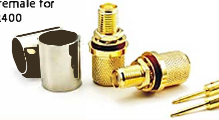
ID035 SMA bulkhead female for 7D-FB RG8 LMR400