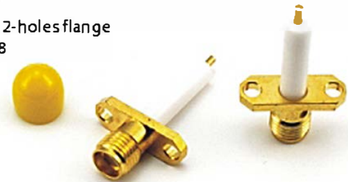
ID048 SMA jack 2-holes flange mount 88