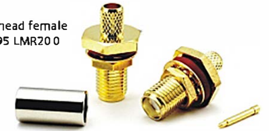
ID032 SMA bulkhead female for LMR195 LMR200