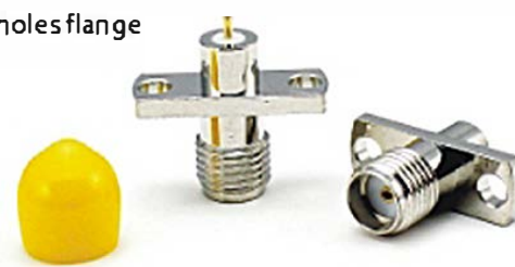
ID044 SMA jack 2-holes flange mount 18