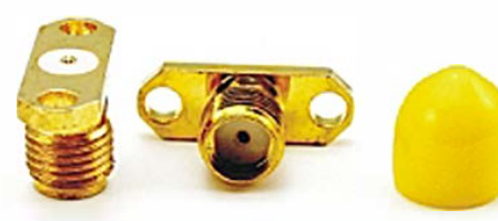
ID046 SMA jack 2-holes flange mount 28